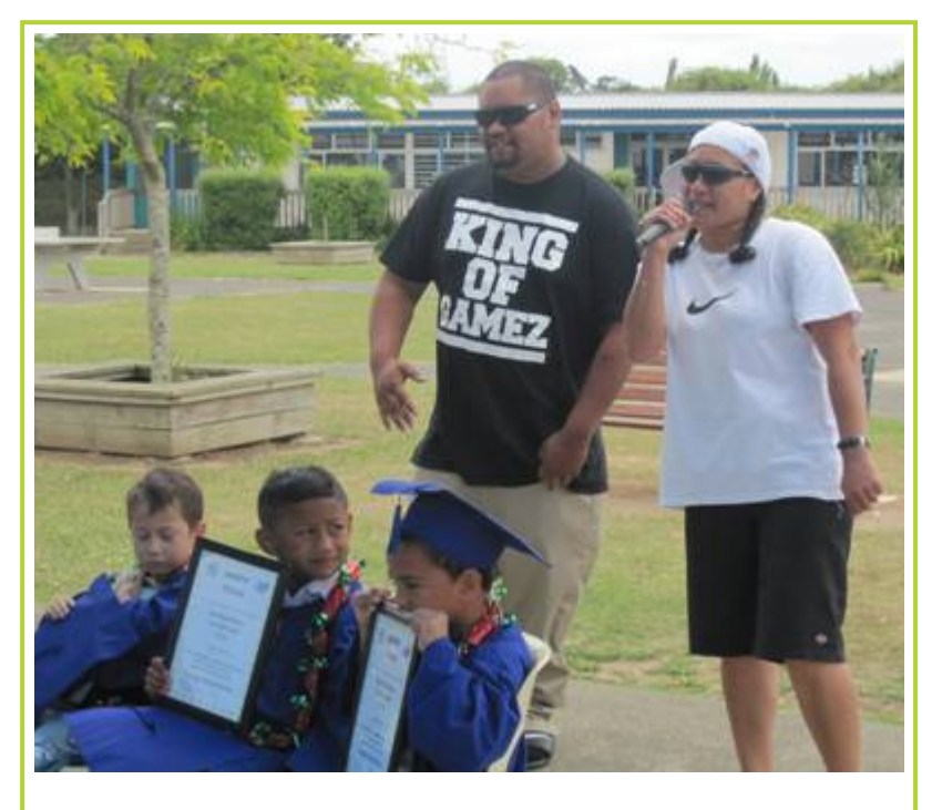
Parents celebrate the children's achievements through rap.