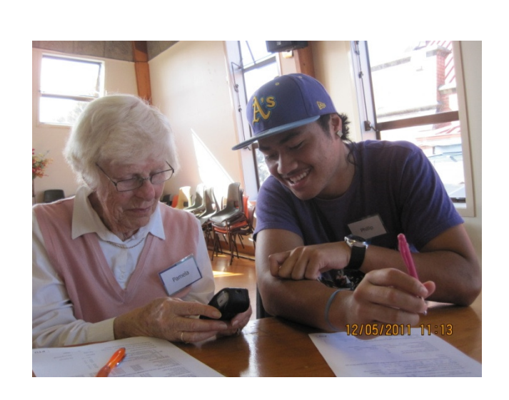
ANNUAL REPORT 2011